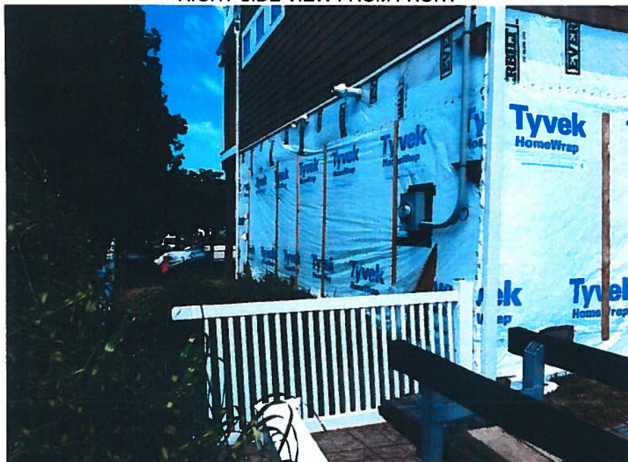
LEFT SIDE VIEW FROM FRONT